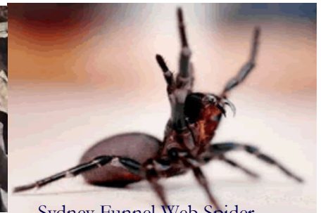
Sydney Funnel Web Spider