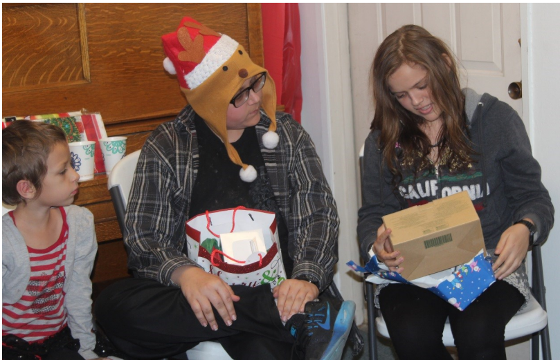
How do I look?