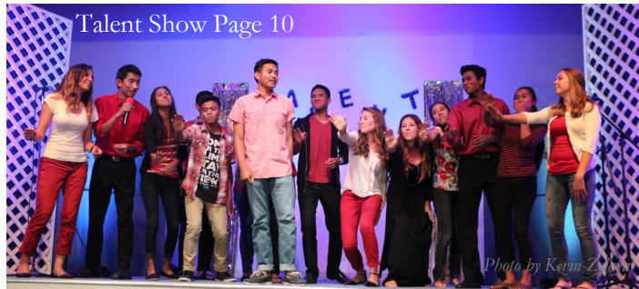
Talent Show Page 10