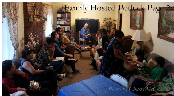
Family Hosted Potluck Page 2