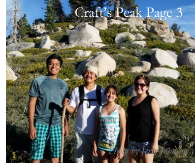
Craft's Peak Page 3