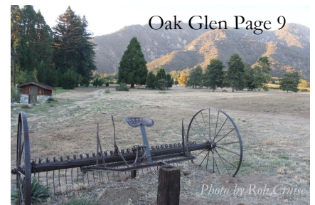
Oak Glen Page 9