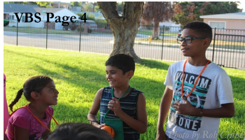
VBS Page 4