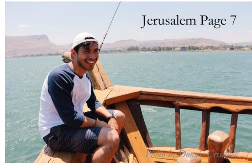
Jerusalem Page 7