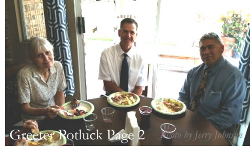
Greeter Rotluck Page 2