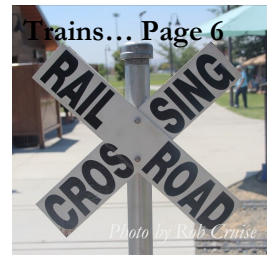
Trains... Page 6