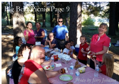
Big Bear Picnic Page 9