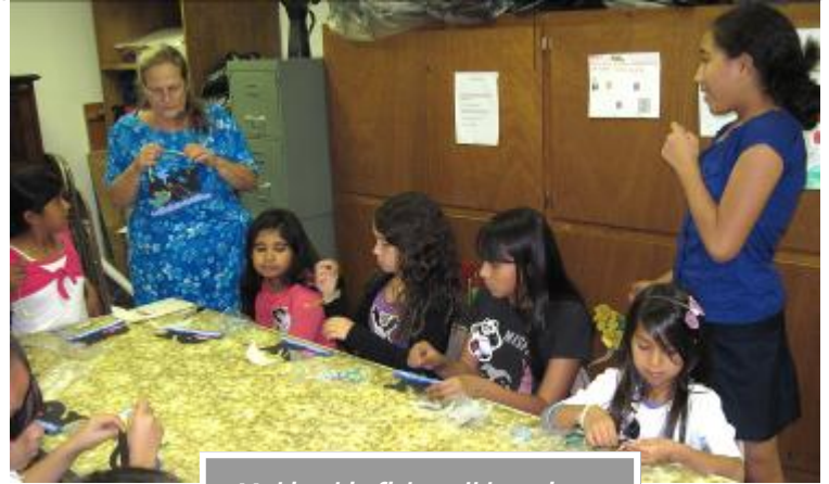
Making big fish wall hangings.

Children of all sizes and a few lucky parents enjoyed children's church on September 10. While the adults received a message for them in the sanctuary the youngest members and visitors enjoyed action packed stories and music just for them.