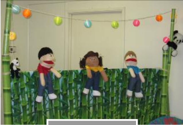
These puppets can sing!