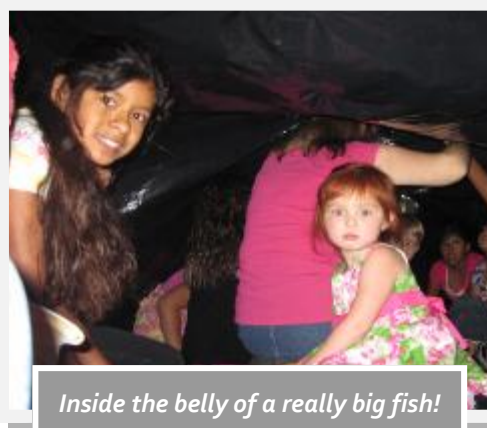
Inside the belly of a really big fish!

A few more songs and one song by the puppets brought the event to closing