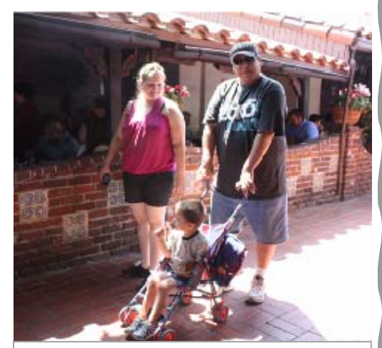
All ages found something of interest.