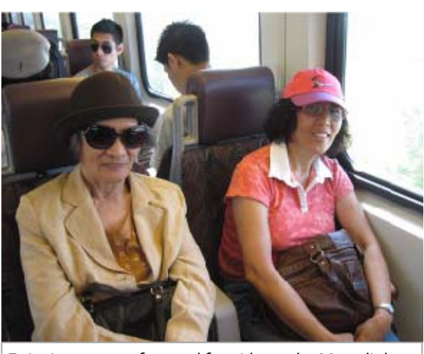
Enjoying a stress free and fun ride on the Metrolink.