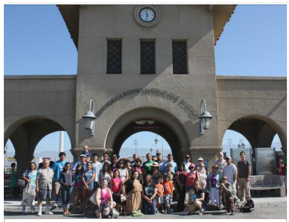
The whole crew! Over 60 people rode Metrolink to L.A. on August 7, 2011.