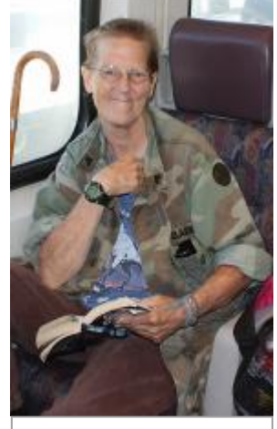
Always a good time to read.