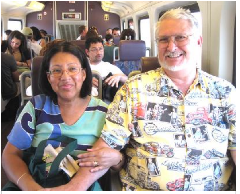
Fearless leaders! Thank-you for all your planning! See all the happy faces!