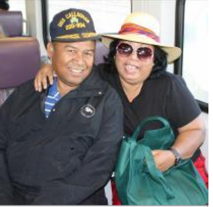
As happy as newlyweds after 40+ years!