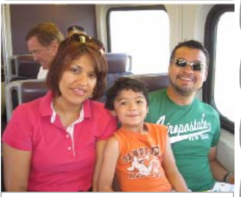
Family togetherness is a blessing!