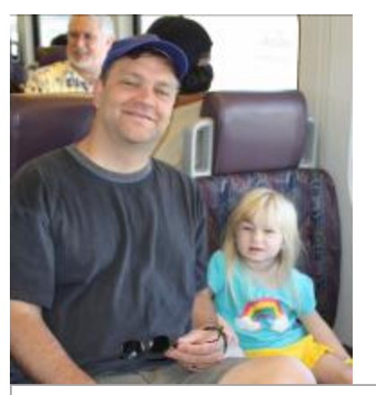
Father-daughter bonding time...Priceless.