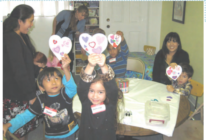
The littlest attenders made hearts to remind them of God's love for them.