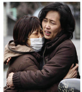
Sisters hug each other when they meet at a makeshift shelter.