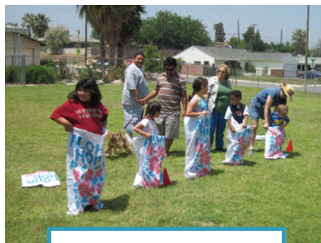
2010 gunny sack race.