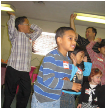
Praising the Lord with heart, soul and body.