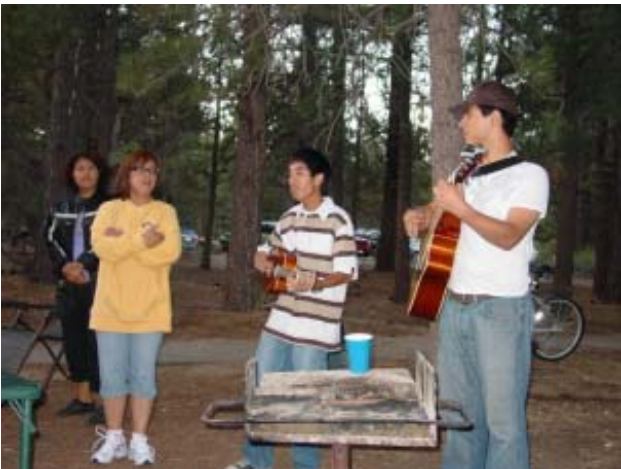
"Singing praise songs at the 2009 Big Bear Lake gathering"